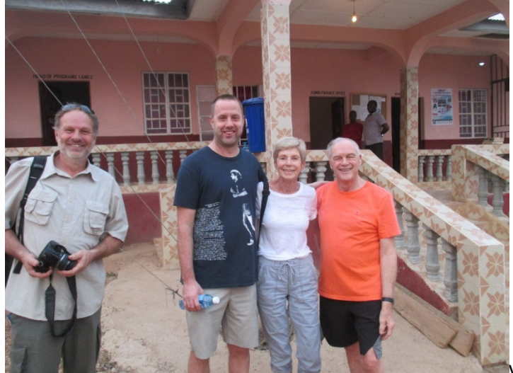
Visit at Shalom radio, a media ministry of