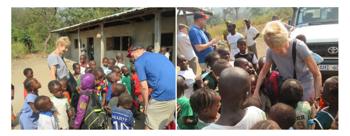
Interacting with kids at the Yirah Filayah crc primary school.