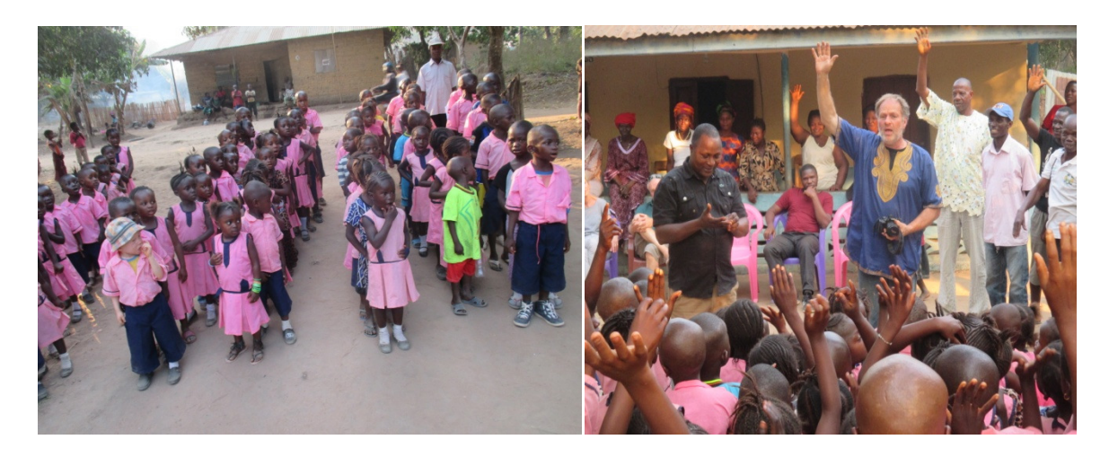
At the newly started Alakalia crc primary school.

CONDITIONS OF THE SCHOOLS: Beside Kabala, and Nanfayie of most of the schools visited have no classroom building where the kids can sit and learn. Most of them use the church building auditorium as classroom on week days. While on Sunday it's used for worship. Secondly most of the teachers are volunteers who needed more training to be qualified as teachers.