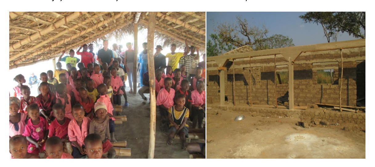
At shekuya, it was pathetic and shocking for the North American to see this place been used as a classroom. But on the right is the new structure World renew through CES is building to provide a good reading and learning environment for the pupils in Shekuya village.