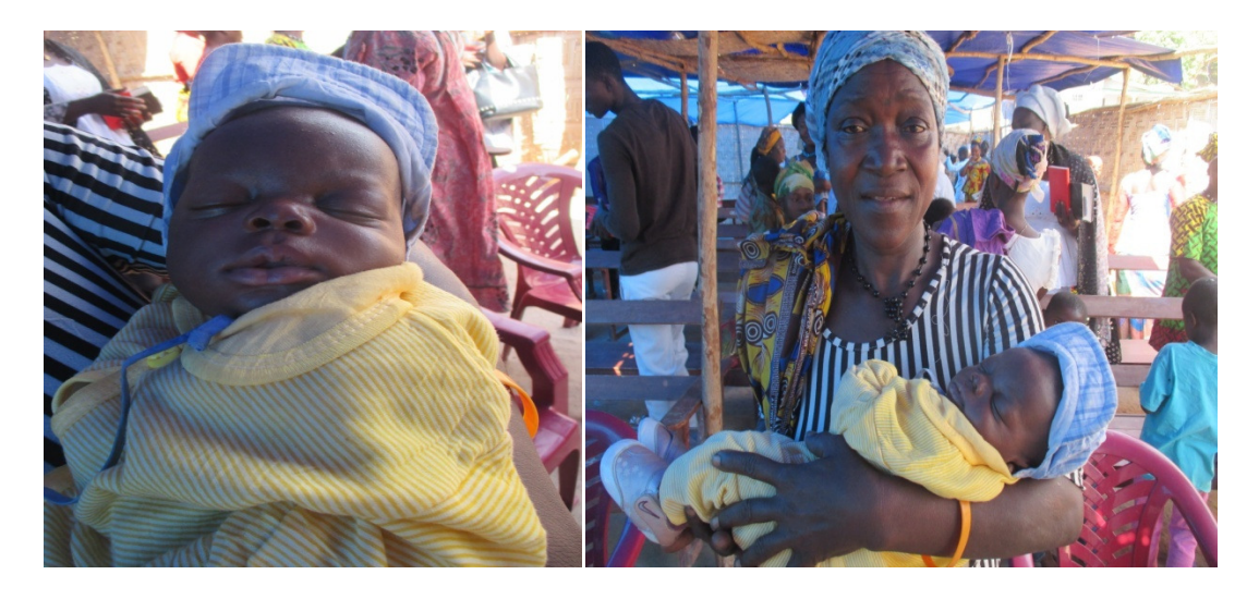
Baby God's gift