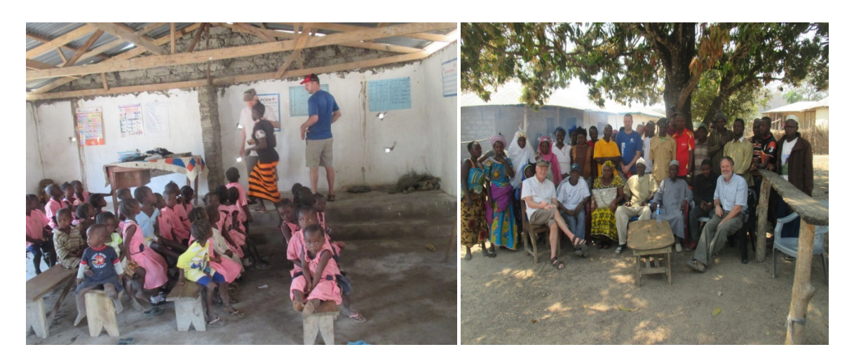
At Firawa crc nursery and primary school, also the team met with the village authority.