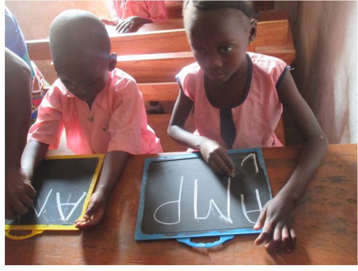
at yarah crc nursery school pupils ,learning